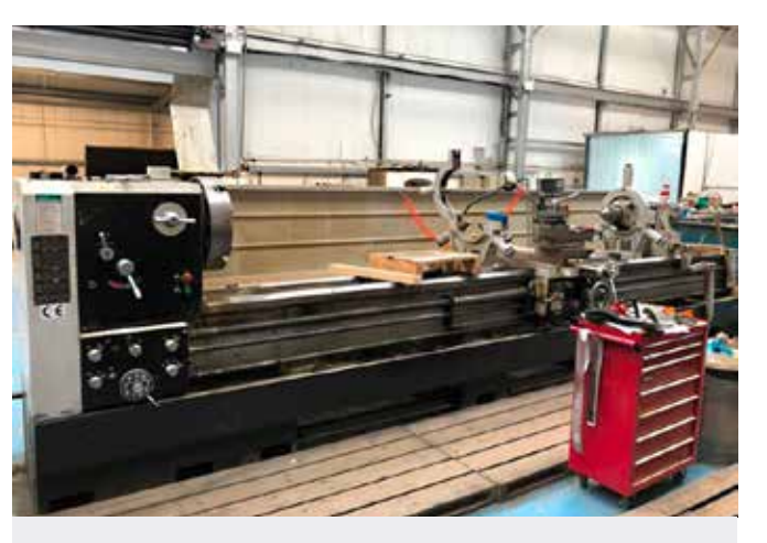
LOT 25: MASCUT MA-3160 Centre Lathe. Swing over bed 750mm. Swing over saddle 500mm. Distance between centres 4,000mm. Year of Manufacture 2012. Reference ML11