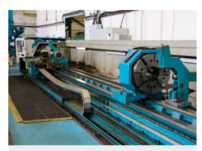
LOT 16: BINNS & BERRY Data 1000 CNC Lathe. Swing over bed 800mm. Swing over saddle 620mm. Distance between centres 12,000mm. FANUC 0i-TC Control. Rebuilt/Retrofitted 2010. Reference CL10