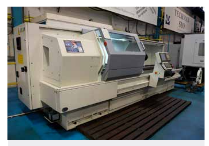
LOT 20: HARRISON Alpha 1550XS CNC Lathe with FANUC 0i-TD Control. Swing over bed 550mm. Swing over saddle 370mm. Distance between centres 3,000mm. Year of Manufacture 2014. Reference CL19