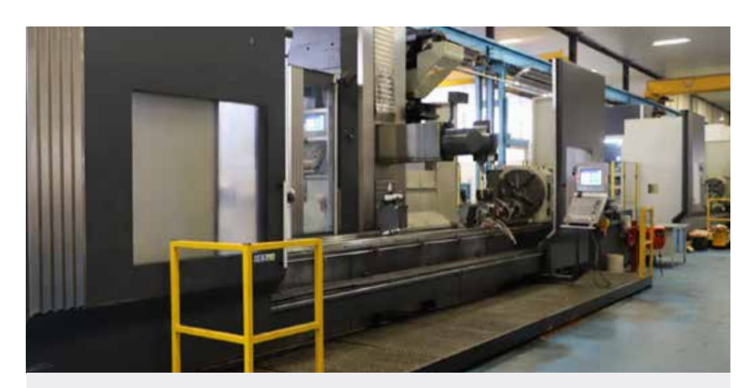
LOT 3: CORREA AXIA CNC Bed Milling Machine with HEIDENHAIN TNC 530i Control Table size 9,000mm x 1,000mm. X/Y/Z Travels 8,500mm/1,500mm/1,250mm 4th Axis attachment 800mm dia. Year of Manufacture 2014. Reference CM19