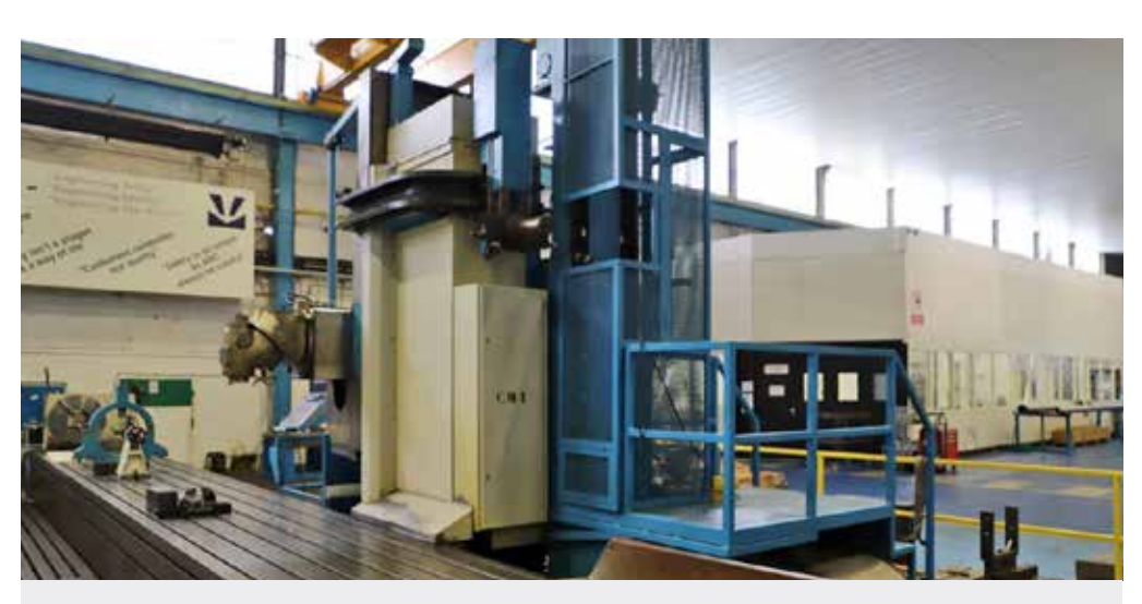
LOT 6: ASQUITH BUTLER HE4000 CNC Bed Milling Machine with HEIDENHAIN TNC 426 Control Table size 10,000mm x 1,180mm. X/Y/Z Travels 8,050mm/1,625mm/1,200mm 4th Axis attachment 630mm dia. Year of Manufacture 1996. Reference CM1