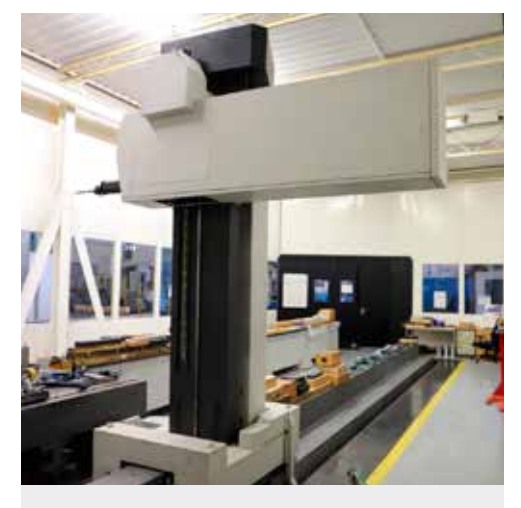
LOT 40: Co-ordinate Measuring Machine Horizontal Arm Type 10,000mm Capacity. Nikken software. Air Conditioning Unit. Tooling/ Probes. Reference INSP1