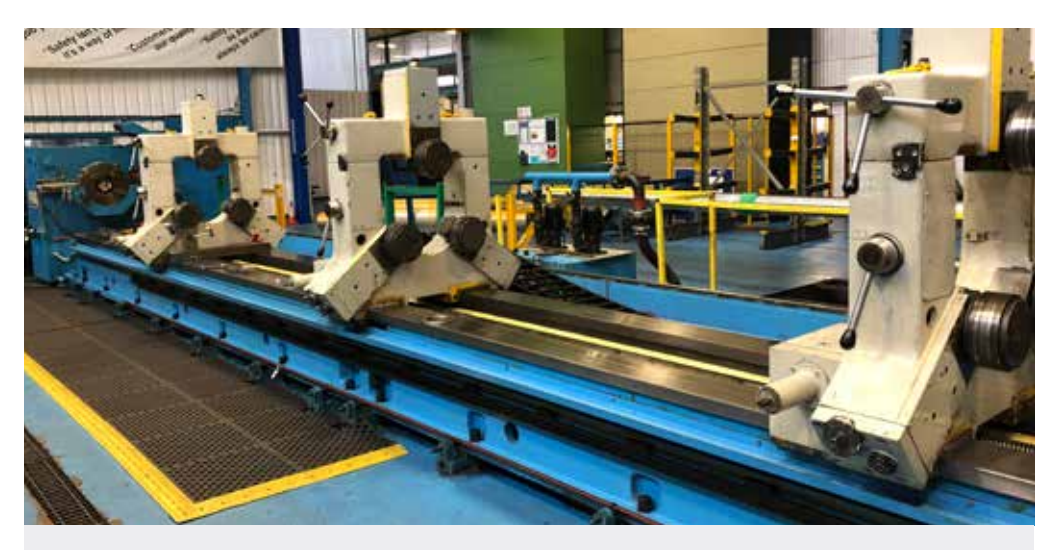
LOT 8: RYAZAN Model RT295115 x 10m Deep Hole Boring Machine. Year of Manufacture 2008. Reference B02