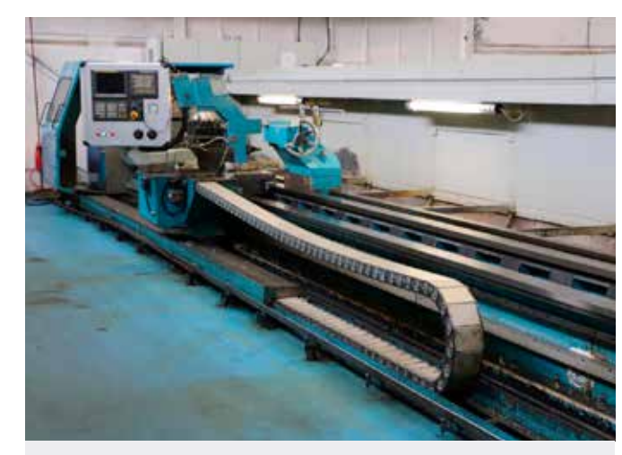
LOT 15: BINNS & BERRY Data 90 CNC Lathe. Swing over bed 800mm. Swing over saddle 620mm. Distance between centres 12,000mm. FANUC 0i-TC Control. Rebuilt/Retrofitted 2008. Reference CL5