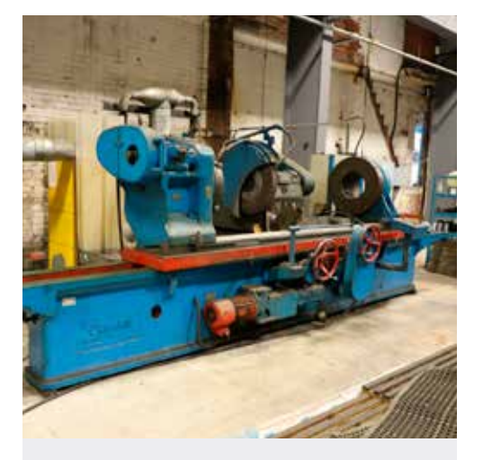
LOT 33: CHURCHILL Cylindrical Grinder. Swing over bed 1,000mm. Thro' spindle tailstock 320mm. Distance between Centres 2,500mm. Reference GR3