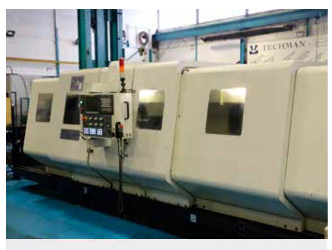
LOT 12: L&L LC38 CNC Lathe. Swing over bed 960mm. Swing over saddle 480mm. Distance between centres 4,000mm. Spindle bore 230mm. FANUC 0i-TD Control. Year of Manufacture 2012. Reference CL16