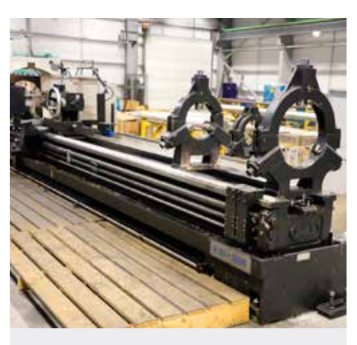
LOT 26: L&L Tuscan A35 x 5000 Centre Lathe. Swing over bed 760mm. Swing over saddle 500mm. Distance between centres 5,000mm. Year of Manufacture 2013. Reference ML14