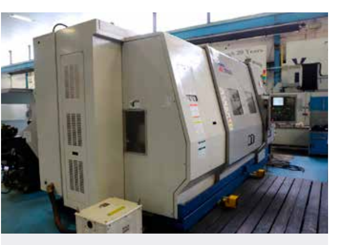
LOT 22: DOOSAN Puma MX2000L Multi Axis CNC Slant Bed Lathe with FANUC 18i-TB Control. Swing over bed 750mm. Maximum Turning dia. 540mm. Distance between centres 1,520mm. Tailstock. B,C & Y Axis. Year of Manufacture 2005. Reference MT2