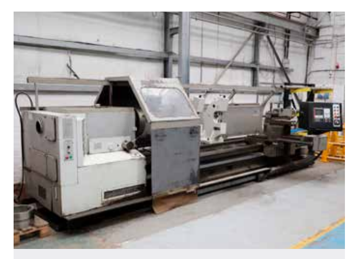
LOT 17: BINNS & BERRY Data 90 CNC Lathe. Swing over bed 900mm. Swing over saddle 720mm. Distance between centres 3,500mm. Retrofitted with FAGOR CNC Control. Retrofitted 1998. Reference CL8