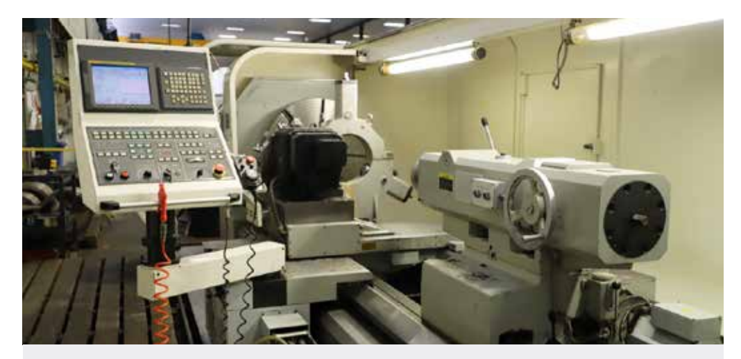
LOT 9: HANKOOK PROTEC 11ND CNC Lathe. Swing over bed 1100mm. Swing over saddle 740mm. Distance between centres 5,000mm. Spindle bore 325mm. Fanuc 21i TB Control. Year 2007. Reference CL4