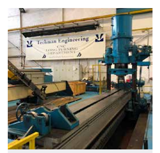
LOT 39: HEC 500 Ton Capacity Hydraulic Travelling Type Straightening Press. Reference PR1