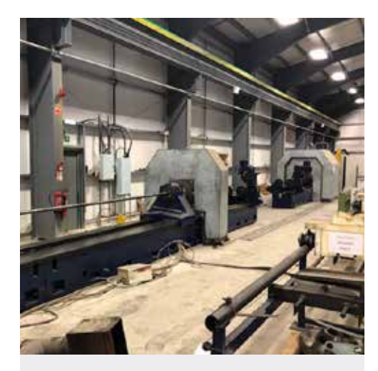
LOT 38: Conventional Hammer Peening Machine. 10,000mm Length. Reference HP1