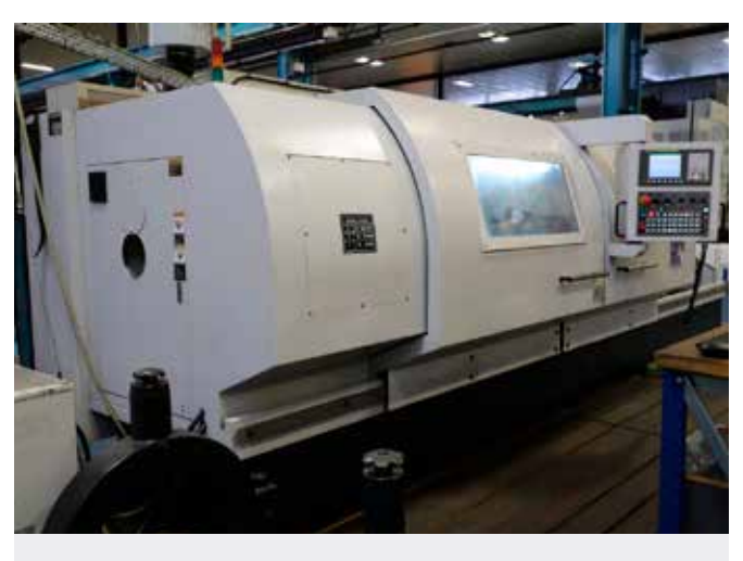
LOT 14: MASCUT AC-25160 CNC Lathe. Swing over bed 670mm. Swing over saddle 400mm. Distance between centres 4,000mm. FANUC 0i-TD Control. Year of Manufacture 2012. Reference CL14