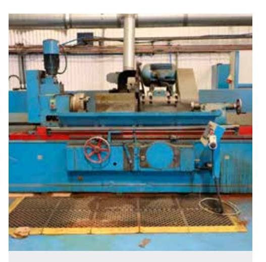
LOT 34: LANDIS MPB CNC Cylindrical Grinder. Swing over bed 500mm. Distance between Centres 1,800mm. Dust extraction unit. Reference GR1