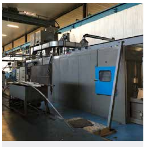
LOT 36: SSCW Shot Peening Machine. External Intensities up to 20°C. Reference SP1