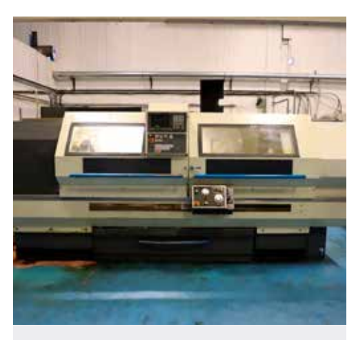
LOT 18: COLCHESTER Mastiff Electronic with FANUC 0i-TD Control. Swing over bed 550mm. Swing over saddle 370mm. Distance between centres 1,800mm. Year of Manufacture 1995. Reference CL7