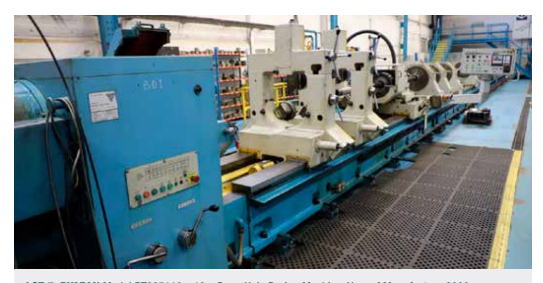
LOT 7: RYAZAN Model RT295112 x 10m Deep Hole Boring Machine. Year of Manufacture 2008. Reference B01