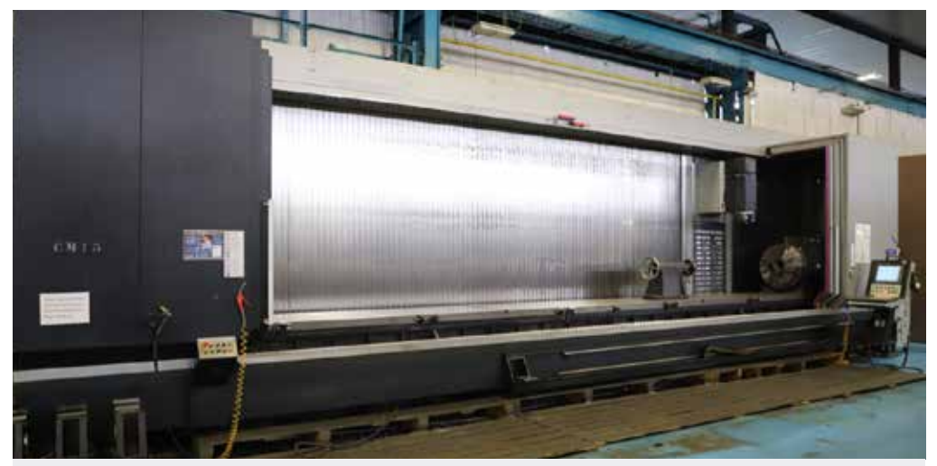
LOT 4: IBARMIA Extreme ZVH8000 CNC Bed Milling Machine with Fanuc 31i Model B control. Table size 9,600mm x 850mm. X/Y/Z travels 8,000mm/1,050mm/1,100mm. 4th axis attachment 630mm dia. Year of Manufacture 2013. Reference CM15