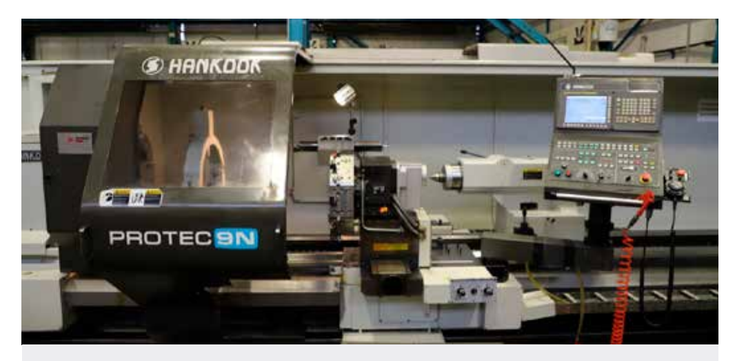
LOT 11: HANKOOK PROTEC 9NC CNC Lathe. Swing over bed 950mm. Swing over saddle 620mm. Distance between centres 4,000mm. Spindle bore 250mm. Fanuc 32i TB Control. Year 2012. Reference CL11