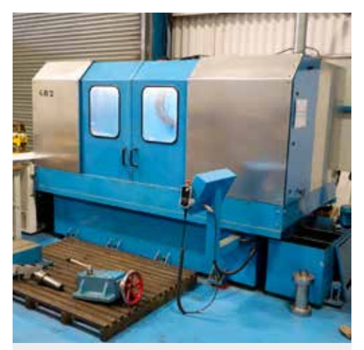
LOT 35: PG MAC CNC Helix Grinding Machine. Swing over bed 485mm. Distance between Centres 1,200mm. Reference GR2