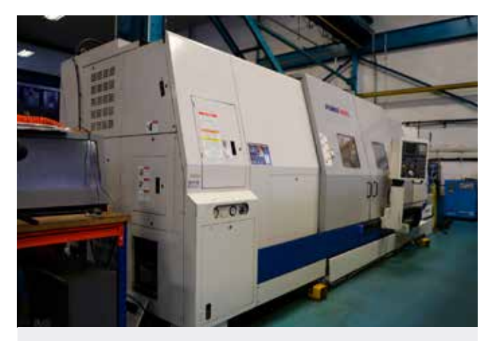
LOT 21: DOOSAN Puma 800L CNC Slant Bed Lathe with FANUC 21i-TB Control. Swing over bed 1,016mm. Maximum Turning dia. 899mm. Maximum turning length 3,200mm. Spindle bore 360mm. Year of Manufacture 2005. Reference CL23