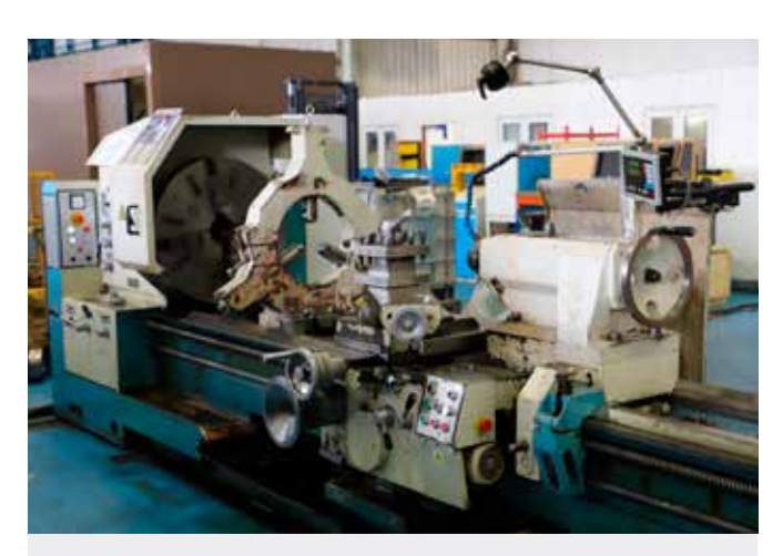
LOT 28: POREBA TPK80 x 5 Centre Lathe. Swing over bed 800mm. Swing over saddle 650mm. Distance between centres 5,000mm. Year of Manufacture 1979. Re-conditioned 2014. Reference ML7