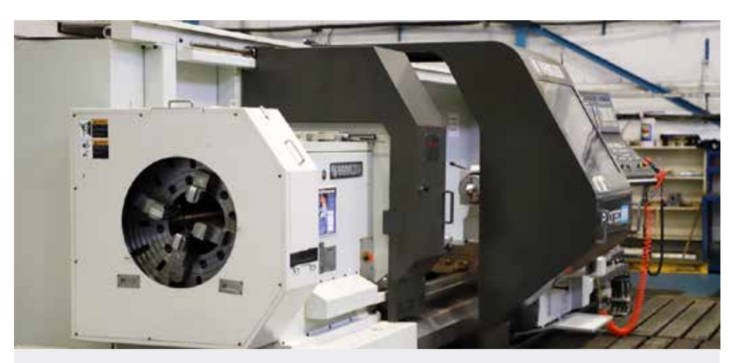
LOT 10: HANKOOK PROTEC 9NC CNC Lathe. Swing over bed 950mm. Swing over saddle 620mm. Distance between centres 4,000mm. Spindle bore 250mm. Fanuc 21i TB Control. Year 2007. Reference CL3