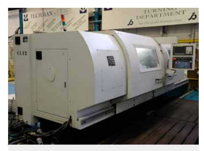
LOT 13: MASCUT AC-25160 CNC Lathe. Swing over bed 670mm. Swing over saddle 400mm. Distance between centres 4,000mm. FANUC 0i-TD Control. Year of Manufacture 2012. Reference CL12