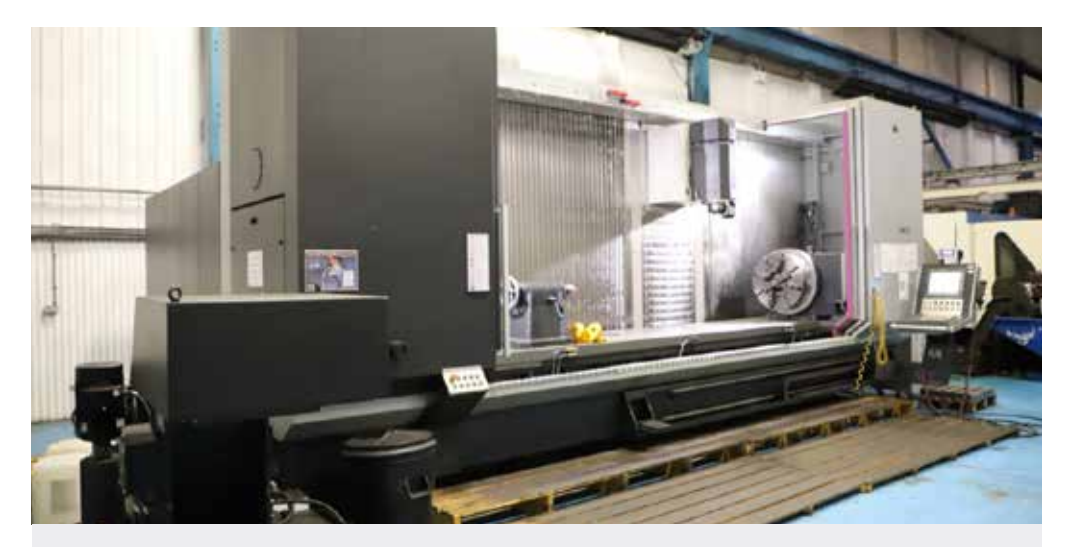
LOT 5: IBARMIA Extreme ZVH4000 CNC Bed Milling Machine with Fanuc 31i Model B control. Table size 5,600mm x 850mm. X/Y/Z travels 4,000mm/800mm/1,050mm. 4th axis attachment 630mm dia. Year of Manufacture 2014. Reference CM17