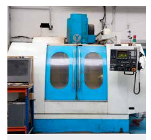
LOT 30: EAGLE Vertical Machining Centre with FANUC 0-MD Control. Table size 1,350mm x 550mm. X/Y/Z Travels 1,300mm/600mm/700mm. 4th Axis Attachment 250mm dia. Reference CM4

Unit A, The Acorn Centre, Oldham, OL1 3NE