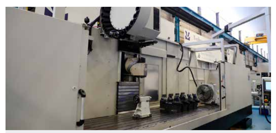
LOT 29: EUMACH FBE 4500 Vertical Machining Centre with Fanuc 31i-Model B control. Table size 4,800mm x 1,050mm. X/Y/Z travels 4,000mm/990mm/1,300mm. 4th axis attachment 500mm dia. Year 2013. Reference CM14