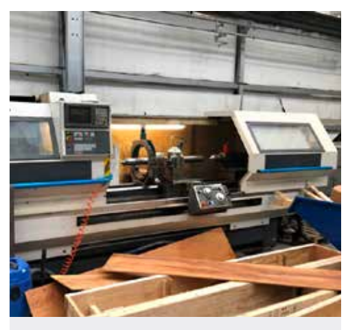
LOT 19: COLCHESTER Mastiff Electronic with FANUC 0i-TD Control. Swing over bed 550mm. Swing over saddle 370mm. Distance between centres 1,800mm. Year of Manufacture 1995. Reference CL6