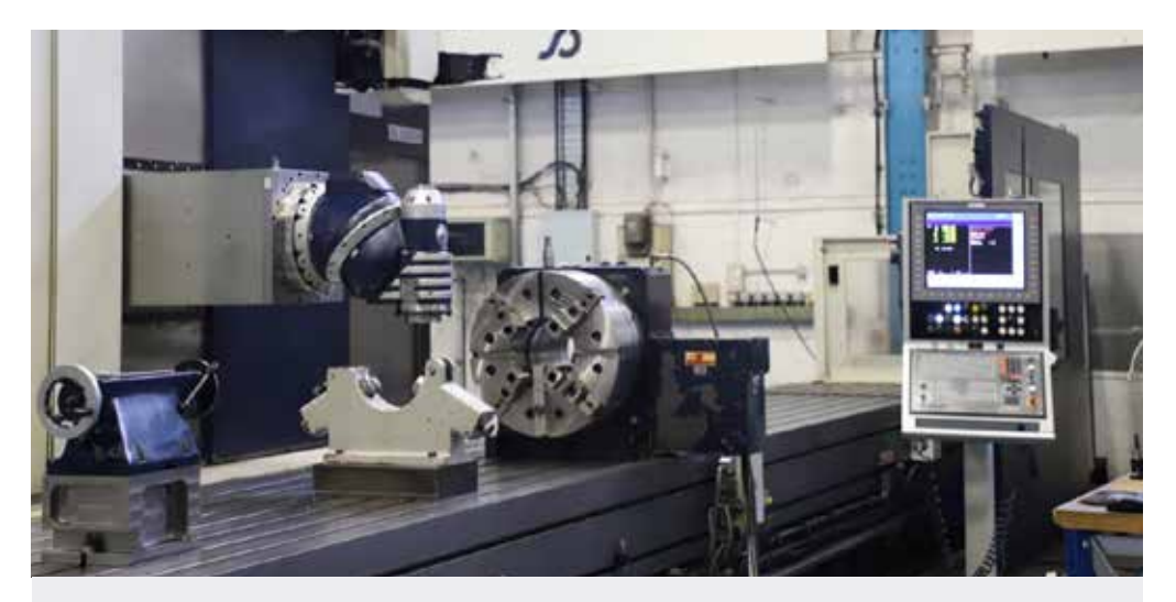
LOT 1: SORALUCE Model SL10000 CNC Bed Milling Machine with HEIDENHAIN TNC530i Control Table size 10,000mm x 1,100mm. X/Y/Z Travels 8,500mm/1,600mm/1,300mm 4th Axis Attachment 630mm dia. x 2. Year of Manufacture 2014. Reference CM16