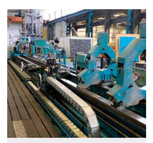
LOT 23: BINNS & BERRY Trident Centre Lathe. Swing over bed 800mm. Swing over saddle 620mm. Distance between centres 12,000mm. Rebuilt in 2008. Reference ML10