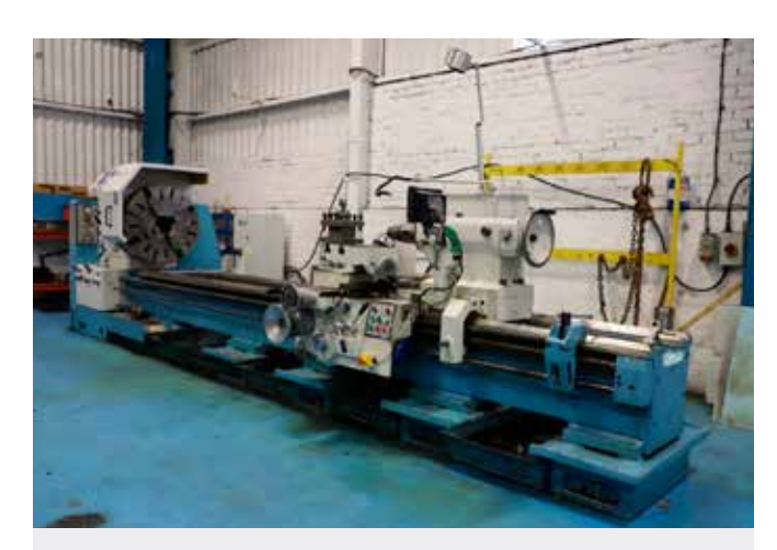
LOT 27: POREBA TPK80 x 4 Centre Lathe. Swing over bed 800mm. Swing over saddle 650mm. Distance between centres 4,000mm. Year of Manufacture 1997. Reference ML6