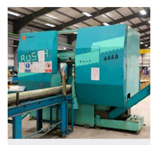
LOT 32: RUSCH 444A Twin-Column Heavy Duty Automatic Horizontal Bandsaw. Year of Manufacture 2005. Reference SAW1

Unit A, The Acorn Centre, Oldham, OL1 3NE