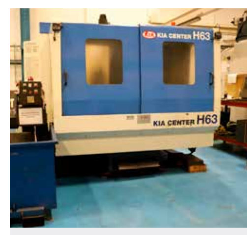
LOT 31: KIA H63 Twin Pallet Horizontal Machining Centre. Pallet size 630mm x 630mm. X/Y/Z travels 950mm/825mm/760mm. B axis. Year 2001. Reference CM20