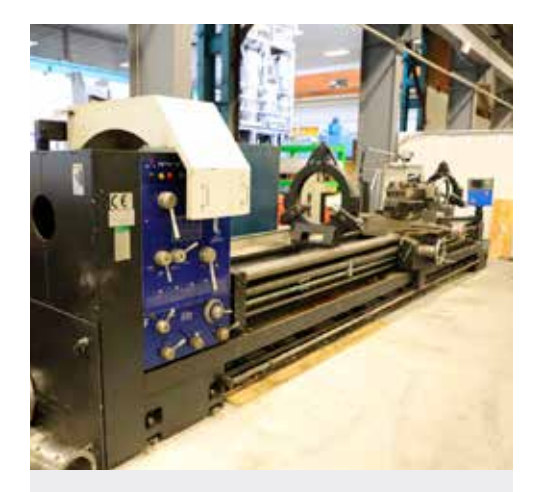
LOT 24: L&L Tuscan A35 x 5000 Centre Lathe. Swing over bed 760mm. Swing over saddle 500mm. Distance between centres 5,000mm. Year of Manufacture 2013. Reference ML12